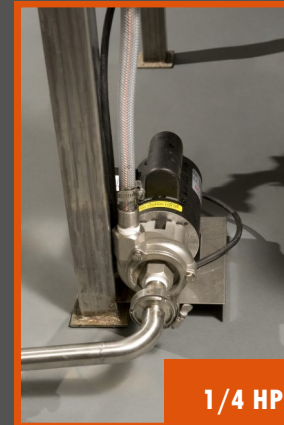
1/4 HP Wash Pump

SMALL FOOTPRINT ON ALL SIZES (34" X 34") TO FIT THROUGH A STANDARD 36" DOOR MAKING IT A VERY VERSATILE FOR MOST SETTINGS