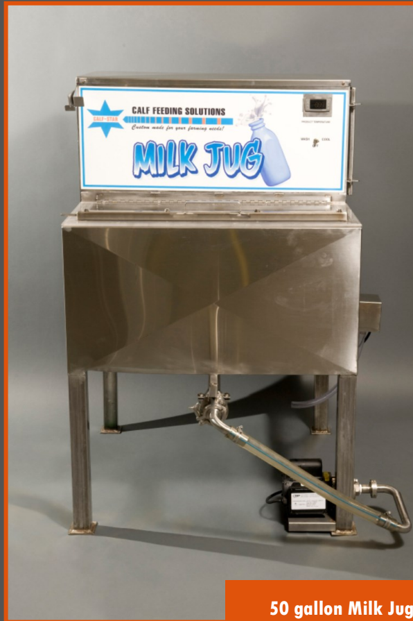
50 gallon Milk Jug